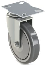
Patented Off-Set King Pin Caster for Increased Stability